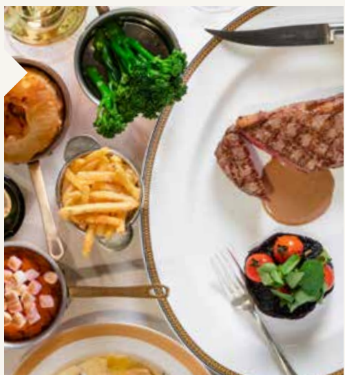
For any occasion, the Steakhouse

Queen Victoria was the first ship to feature private theatre boxes – you can even watch a Cunard Insights talk, with your cup of tea, in your own den of luxury.